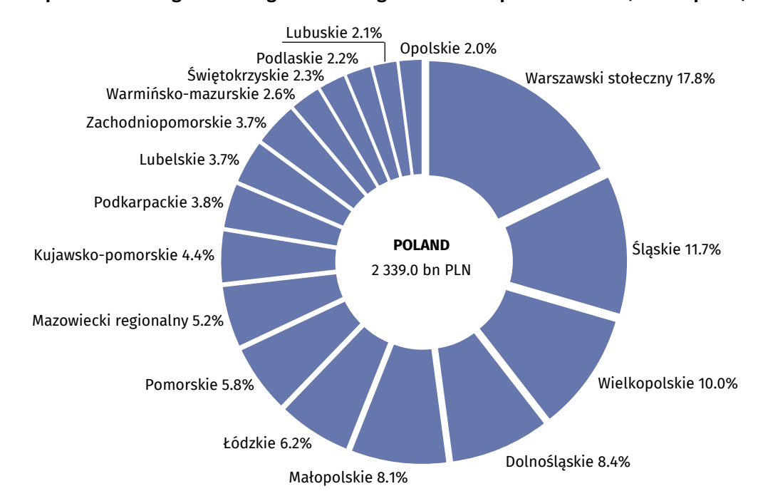
Graph 1. Share of regions in the generation of gross domestic product in 2020 (current prices)

In 2020, there were 15 regions where GDP in current prices increased compared to the previous year