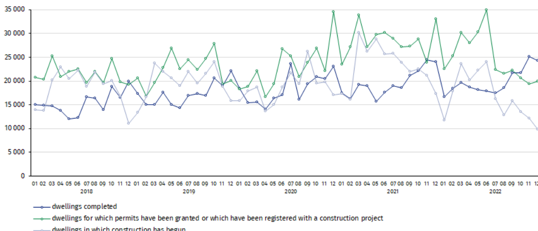
Chart 1. Construction activity in the scope of residential construction in Poland

In December, compared to November 2022, the number of dwellings for which permits have been granted or which have been registered with a construction project increased (by 3.2%), whereas the number of dwellings completed and the number of dwellings in which construction has begun decreased (respectively by 3.1% and 18.8%)