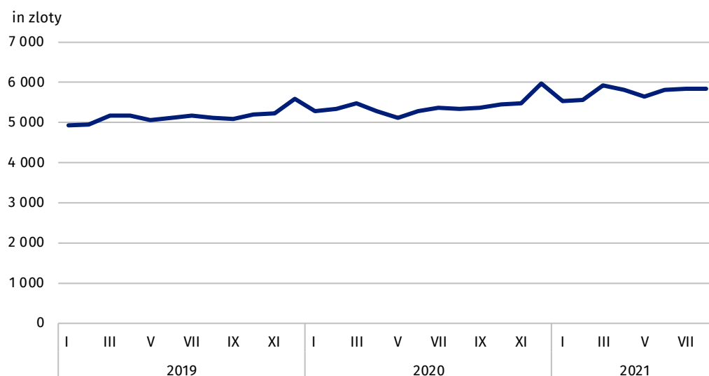
Chart 2. Average monthly gross wages and salaries in enterprise sector