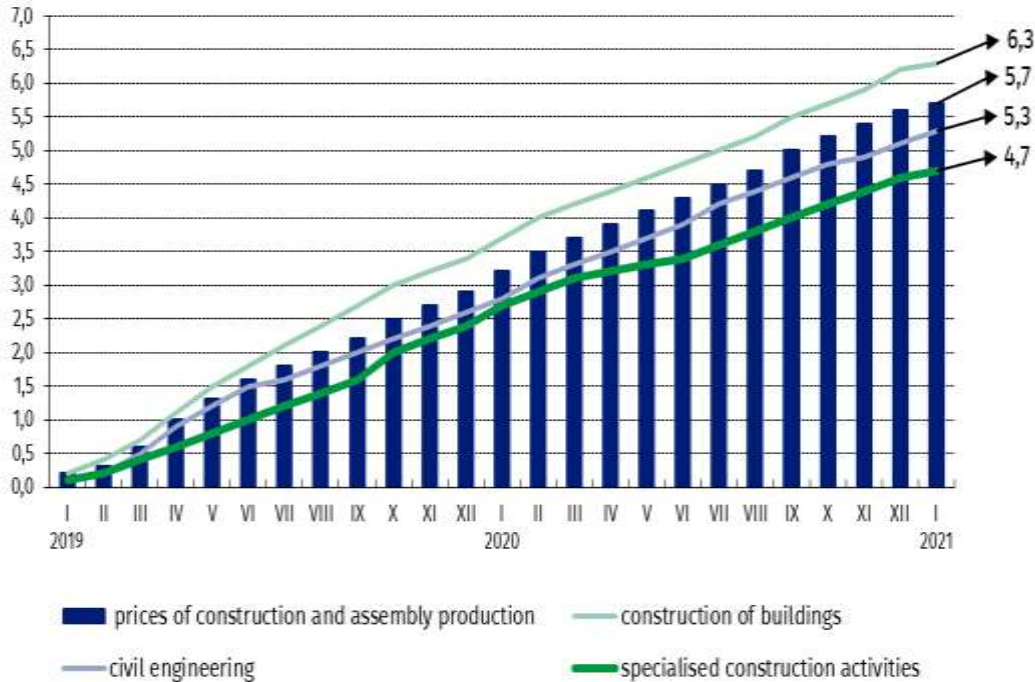
Chart 3. Prices changes of production and assembly construction by divisions NACE in 2019-2021 in relation to December 2018 (in %)

Starting from January 2019 the highest prices growth is recorded in construction of buildings