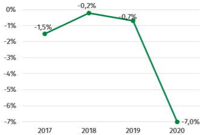
Graph 2 General government debt in % of GDP