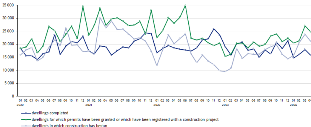
Chart 1. Residential construction in Poland

In April 2024, compared to March 2024, the number of dwellings completed as well as the number of dwellings for which permits have been granted or which have been registered with a construction project and the number of dwellings in which construction has begun decreased (respectively by 11.5%, 8.4% and 10.8%)