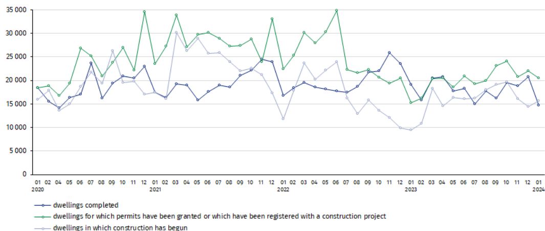
Chart 1. Residential construction in Poland

In January 2024, compared to December 2023, the number of dwellings completed as well as the number of dwellings for which permits have been granted or which have been registered with a construction project decreased (respectively by 28.9% and 6.8%), whereas the number of dwellings in which construction has begun increased (by 9.3%)