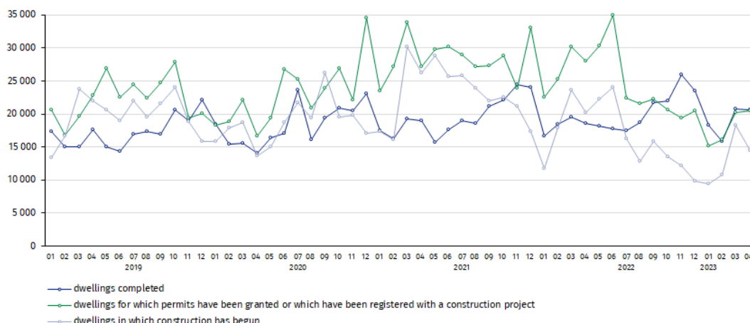
Chart 1. Residential construction in Poland

In April, compared to March 2023, the number of dwellings completed and in which construction has begun decreased (respectively by 0.6% and 20.7%), whereas the number of dwellings for which permits have been granted or which have been registered with a construction project increased (by 1.1%)