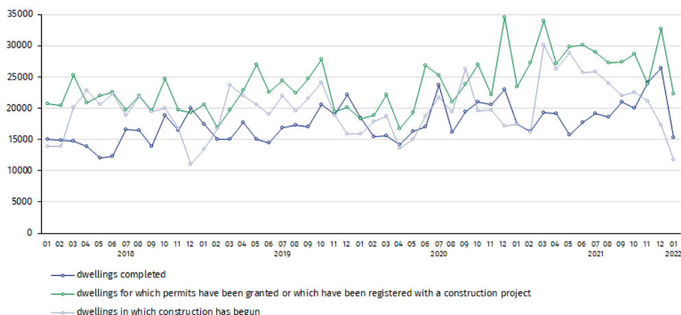
Chart 1. Construction activity in the scope of residential construction in Poland

In January 2022, compared to December 2021, the number of dwellings completed decreased (by 41.9%), as well as the number of dwellings for which permits have been granted or which have been registered with a construction project (by 32.1%) and the number of dwellings in which construction has begun (by 32.0%)