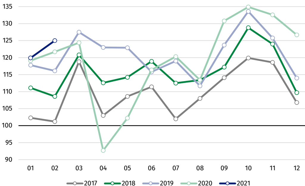
Chart 1. Sold production of industry (average monthly level in 2015=100)

In February 2021, as compared to the previous year, a decrease of production was recorded in three main industrial groupings. The production of capital goods decreased by 3.5%, energy – by 2.9% and non-durable consumer goods – by 2.1%. An increase was observed in the production of durable consumer goods – by 13.3% and intermediate goods – by 6.2%.