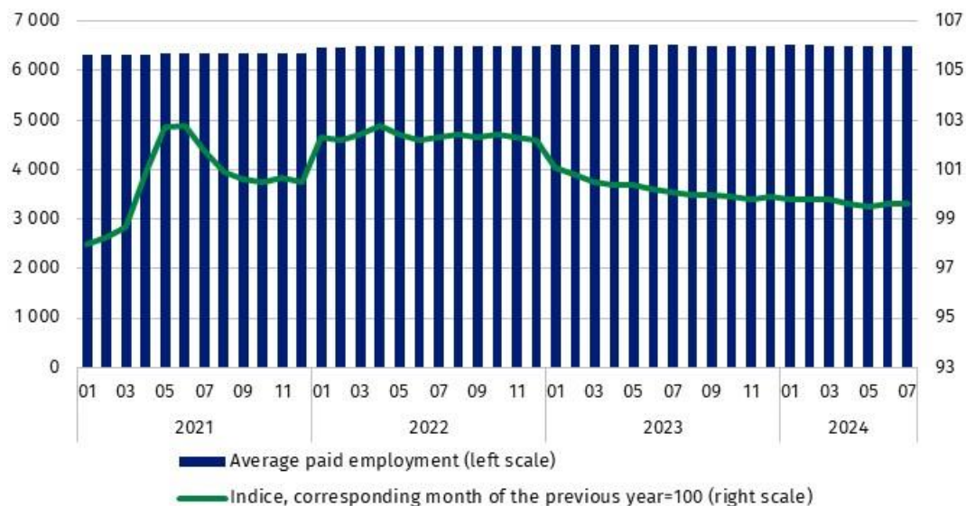
Chart 1. Average paid employment in the enterprise sector

In July 2024, the average monthly gross wage and salary in the enterprise sector increased nominally by 1.6% compared with June 2024. This increase was due to the payment of i.a. bonuses and awards, including incentive, quarterly and semi-annual ones, service anniversary awards, retirement severance pays (which, in addition to base salaries, are also included among the components of wages and salaries 2 ) as well as due to pay rises.