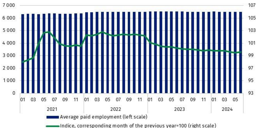
Chart 1. Average paid employment in the enterprise sector

In June 2024, the average monthly gross wage and salary in the enterprise sector increased nominally by 1.8% compared with May 2024. This increase was due to the payment of i.a. bonuses, awards and overtime pays (which, in addition to base salaries, are also included among the components of wages and salaries 2 ).