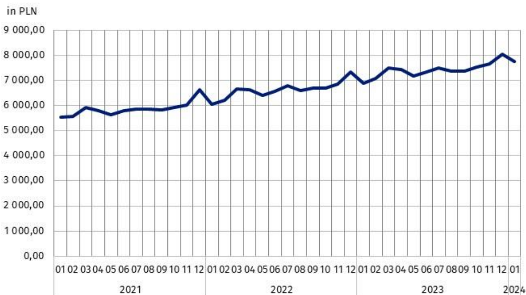
Chart 2. Average monthly gross wages and salaries in the enterprise sector

Average monthly gross wage or salary in the enterprise sector include the base salary and additional salary components, including bonuses, awards, overtime pay and retirement severance pays