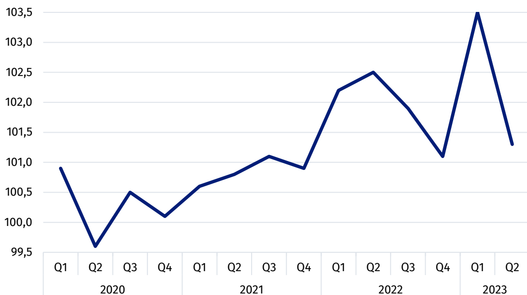
Chart 2. Producer price changes of business services in 2020-2023 (corresponding period of the previous year = 100)