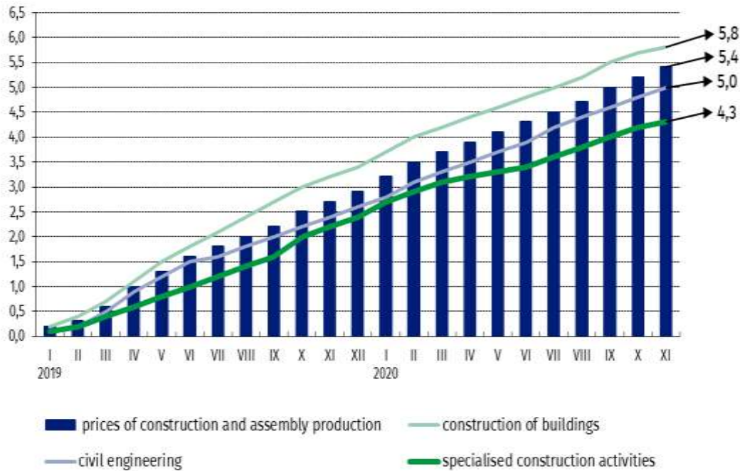
Chart 3. Prices changes of production and assembly construction by divisions NACE in 2019-2020 in relation to December 2018 (in %)

Starting from January 2019 the highest prices growth is recorded in construction of buildings