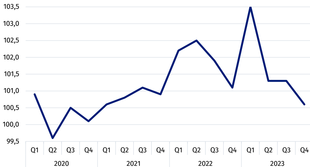
Chart 2. Producer price changes of business services in 2020-2023 (corresponding period of the previous year = 100)