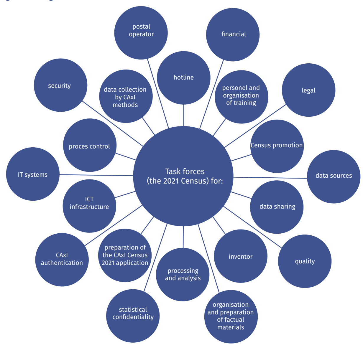
Diagram showing the CBS Task Forces

Within the CBS there were also, originating from task groups: