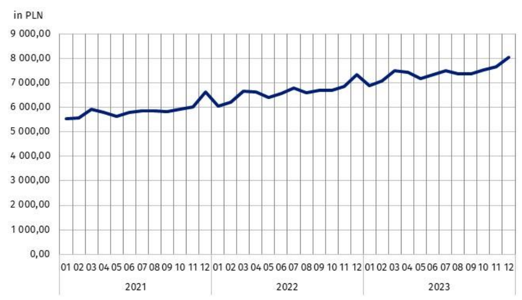
Chart 2. Average monthly gross wages and salaries in the enterprise sector

In July 2023, the statutory minimum salary was raised to PLN 3 600, i.e. by 19.6% compared with 2022, when it amounted to PLN 3 010 (in 2022 an increase of 7.5% compared with 2021), which also affected changes in average monthly gross wages and salaries in the enterprise sector