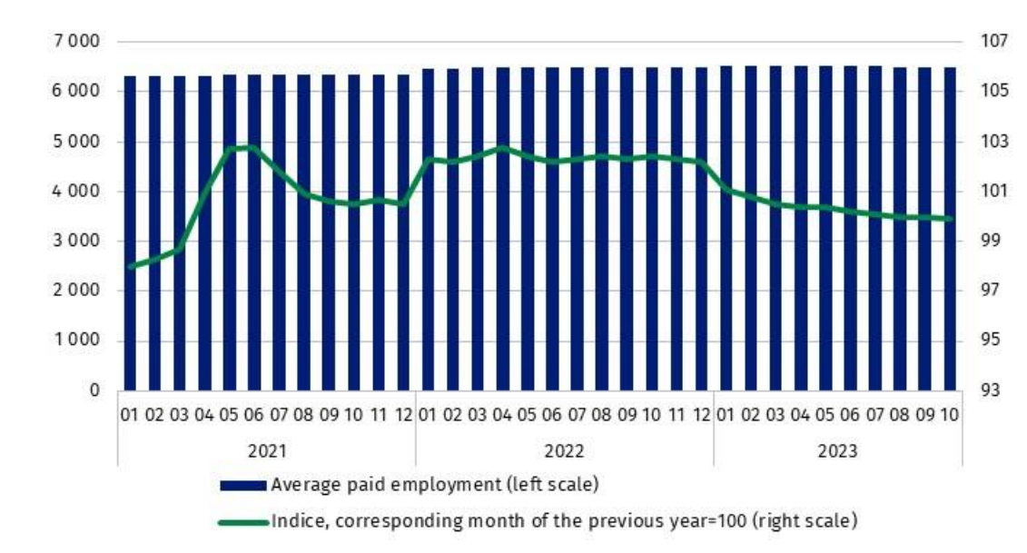
Chart 1. Average paid employment in the enterprise sector

Comparing October 2023 to October 2022, the average paid employment decreased by 0.1%.